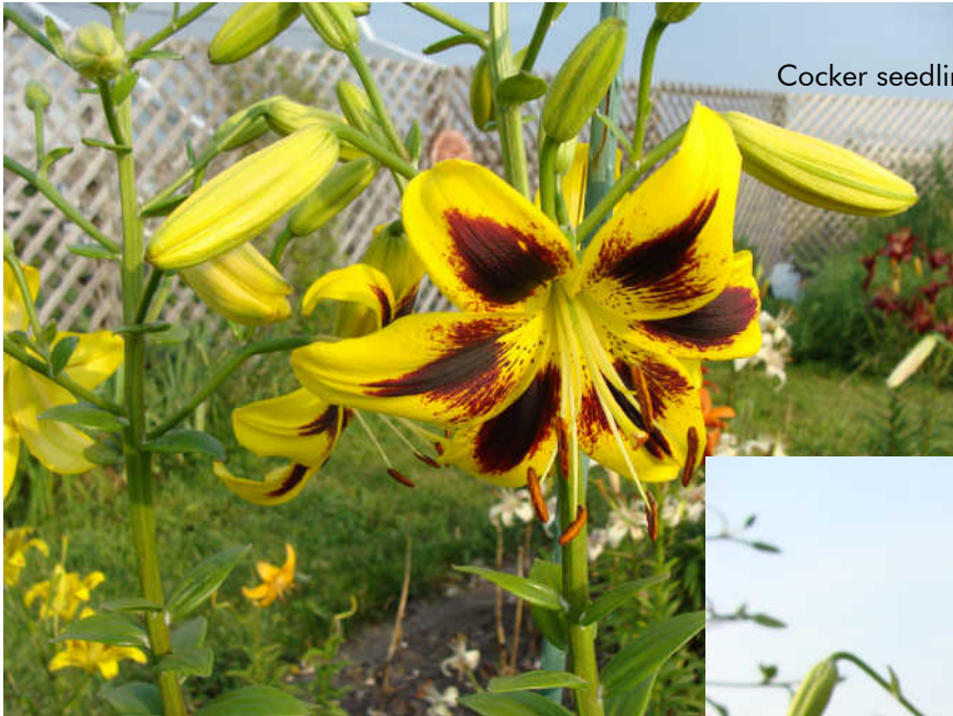
Cocker seedling 81-89