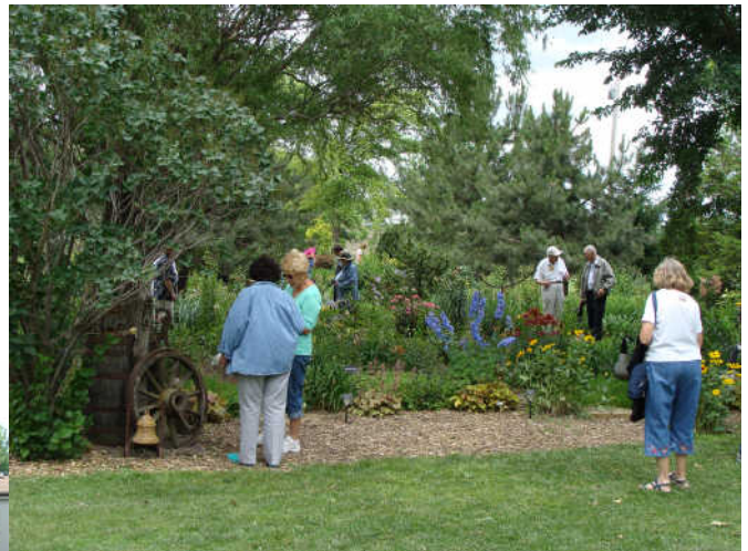
One last look at those great gardens from the NALS 2013 Garden Tour!